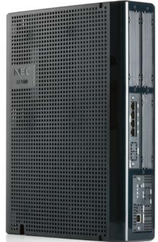
SL2100 Communications Server