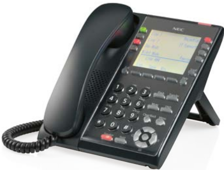
SL2100 IP Terminal