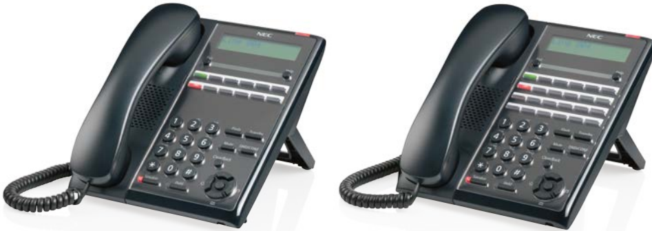
SL2100 Multi-line Terminals