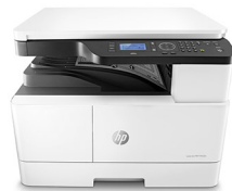
HP LaserJet MFP M438dn