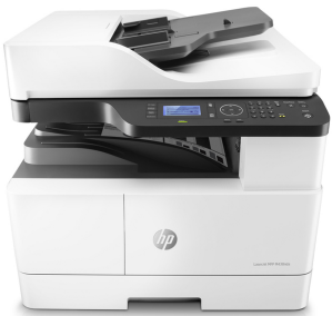
HP LaserJet MFP M438nda