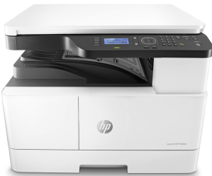
HP LaserJet MFP M438dn