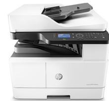
HP LaserJet MFP M438nda