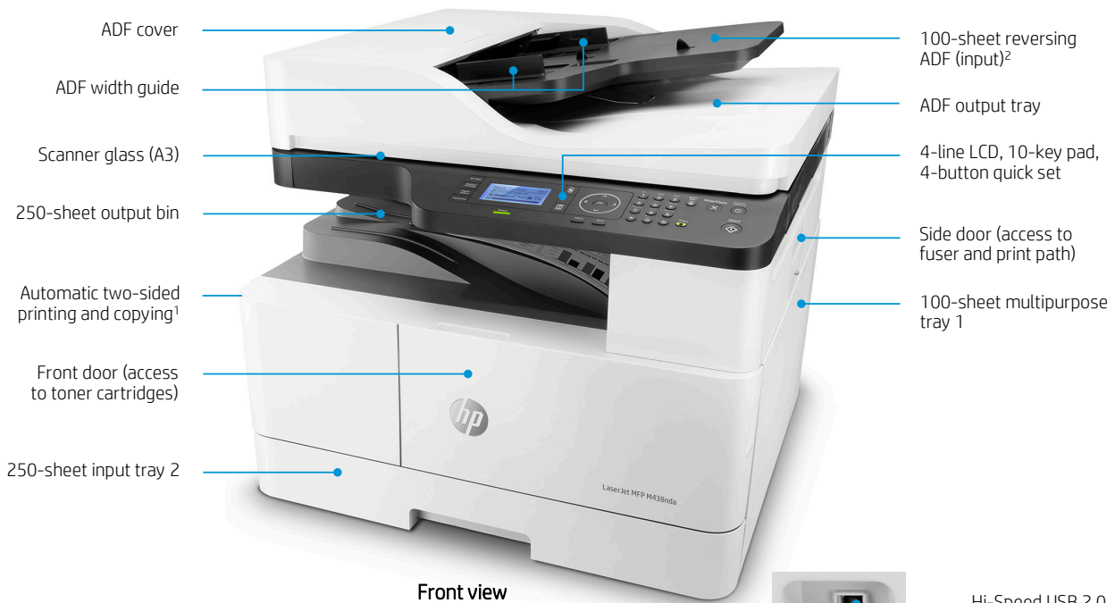
HP LaserJet MFP M438nda shown